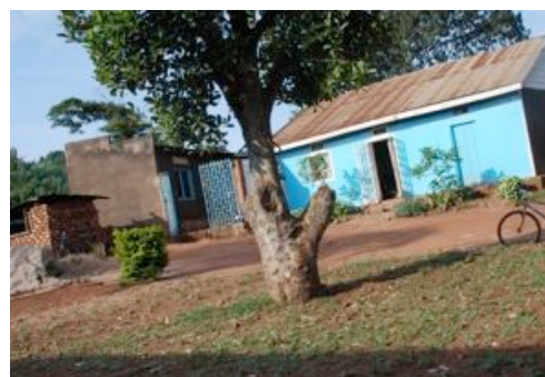
Below: Alice's former home, now a part of Awegys school.

“What sculpture is to a block of marble, education is to the soul.”