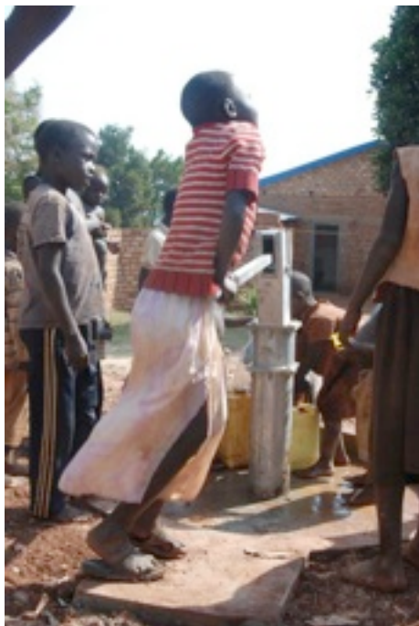
A young girl from the surrounding village pumps water in to a jerrycan. Funded by Rosa International Middle School through the Mtaala Foundation, the well provides clean water to the Awegys School and Kigo village.

Since the well's completion, Awegys students and local residents savor the joy of clean water each day.